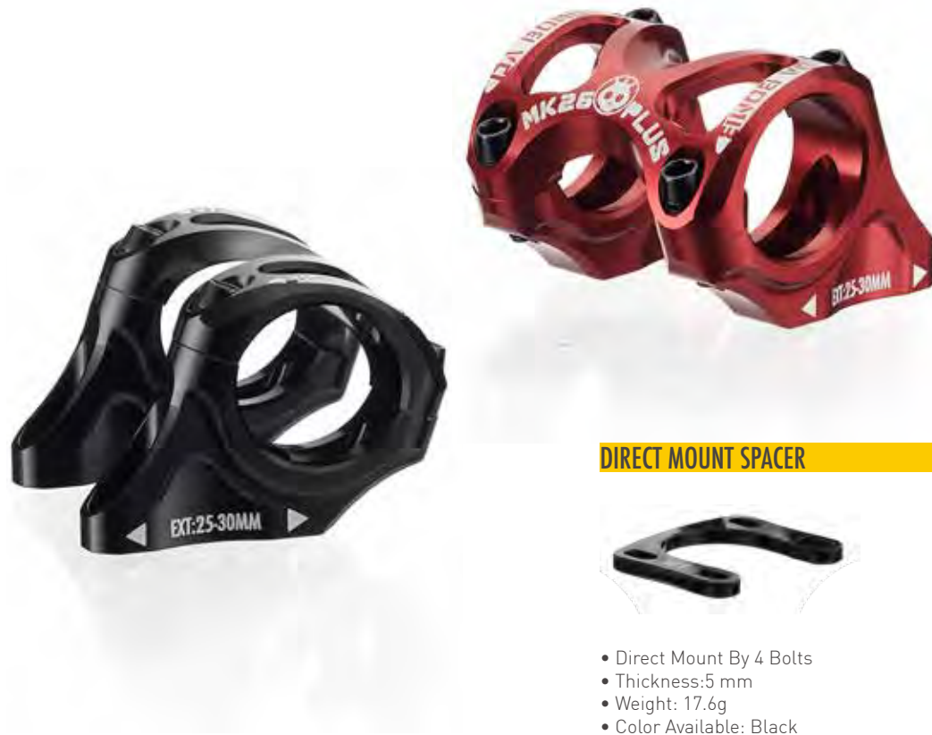
DIRECT MOUNT SPACER